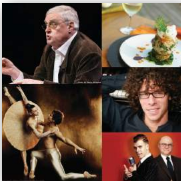
Noosa Long Weekend 15 - 24 Jul 2016 Free + various ticketed events around Noosa