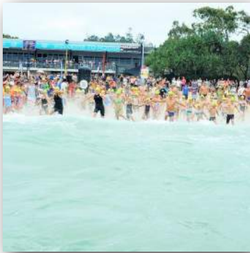
Noosa Open Day - World Series at Main Beach, Noosa Heads 26 Jun 2016 - 8am-noon

Quarterly publication of Parkyn Hut Information Centre