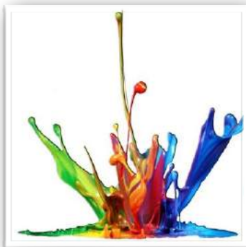
Noosa Open Studios Fri 19 Aug- Sun 21 Aug 2016 Wallace House + artists studios